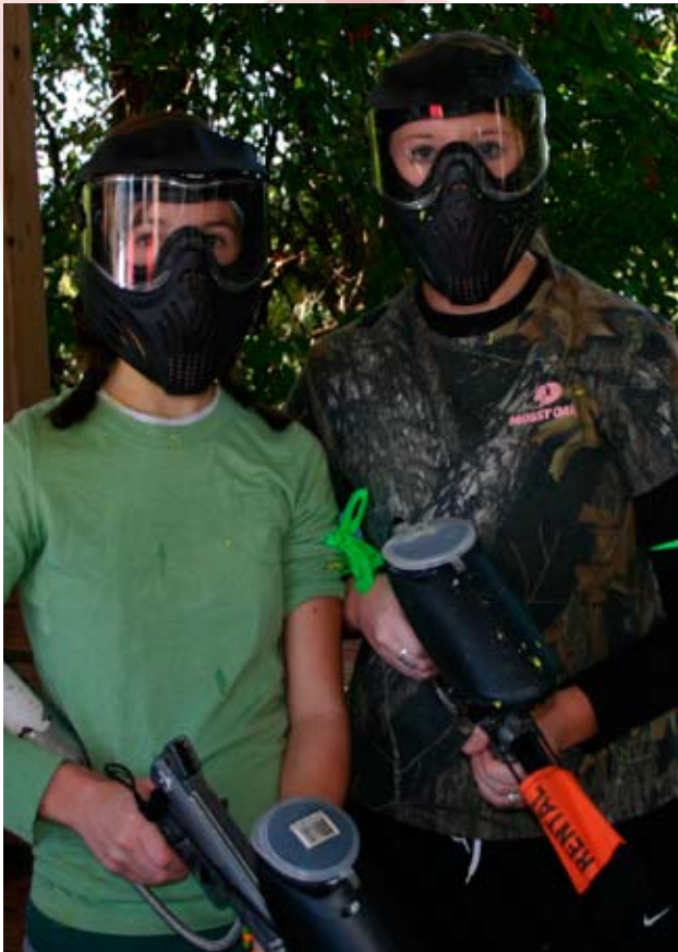
Here are a couple of Metro teens who participated in the "Paintball Adventure" on Saturday, October 3, in Bessemer.